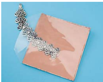
High Surface Area