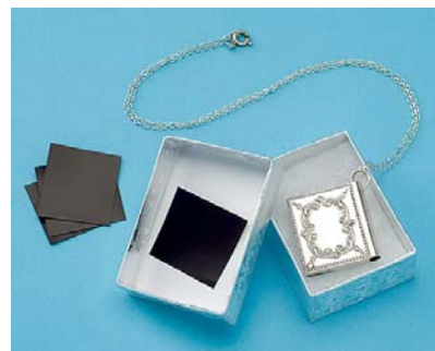
Protection Using Intercept Tabs

No Oils / No Volatiles / No VCI's / No Contamination / No tarnish / Just 20 Years Proof sales@conservation-by-design.co.uk