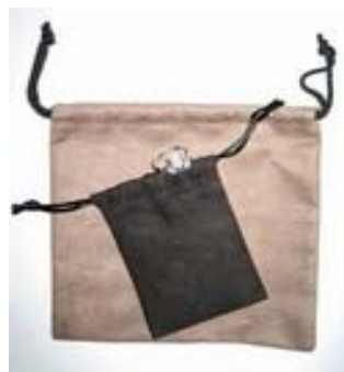
Intercept Coated Fabric Pouches