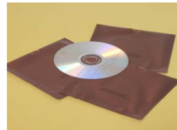
Digital Data (CD / DVD) and other media