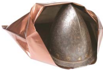
Ferrous and Non-Ferrous Metals